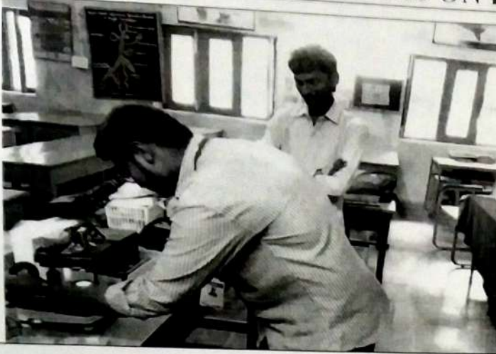
Identification of parasites in Electron microscope