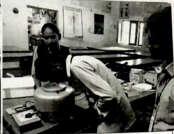
Centrifuge process in blood samples