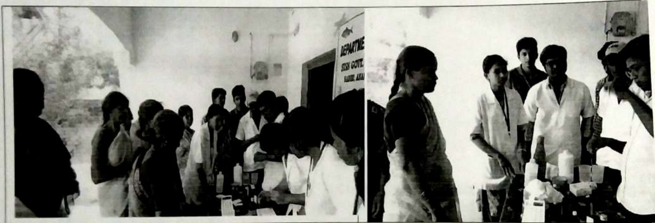
Sample collection, preparation and staining